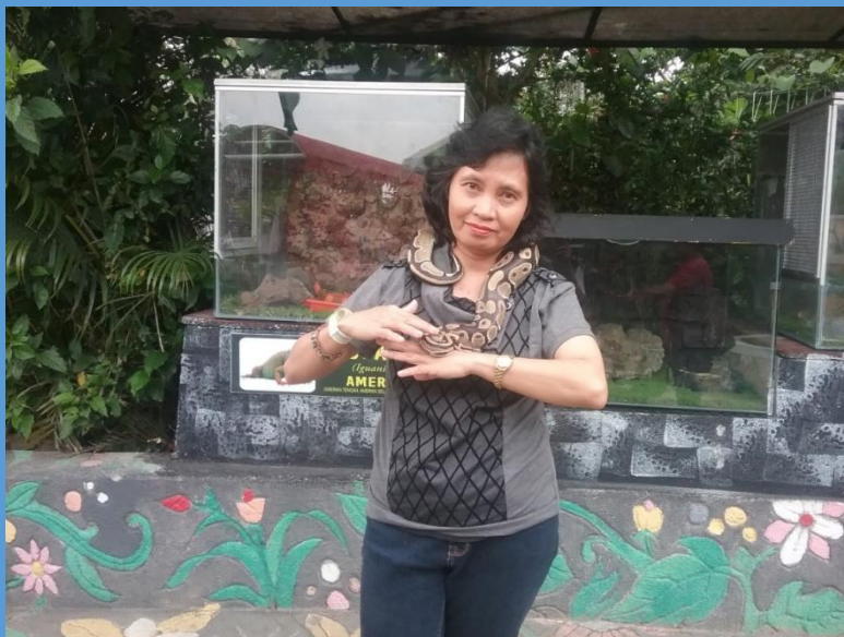
This picture was taken when I visited Jatim Park.

Read the caption on this picture, then give your comment on it!